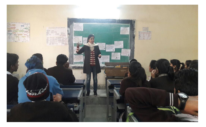
Image 1.2: The researcher explaining the Indexing of different concepts