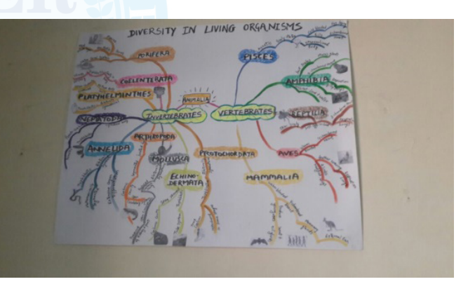
Image 1.4: The final Mind Map prepared by the students in Group work on 'Diversity in living organisms'